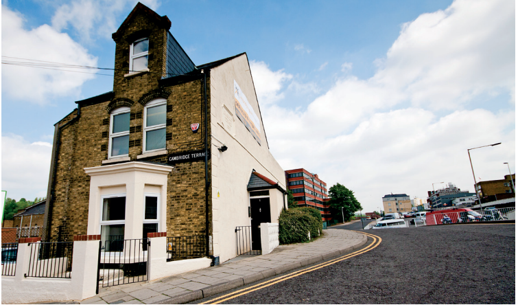
Parking? That's easy

Each office has a FREE reserved parking space in our adjoining CCTV secure parking area. We are also located next to several inexpensive all-day pay and display car parks making it easy for your staff and clients to park.